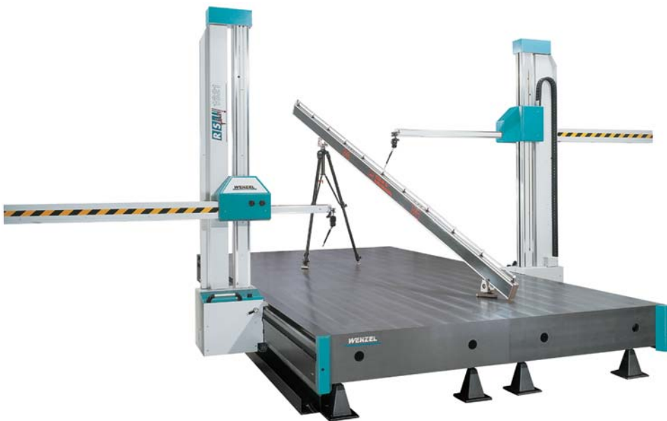
Figure 1: KOBA-Ball Bar on a CMM of horizontal arm type

have been lined up by means of a clamping unit with reproducible force in the axial direction and support themselves upon a fixed skewback (springer) at the opposite end. Thereby changes in the length occurring due to the varied pre-stress forces are avoided.