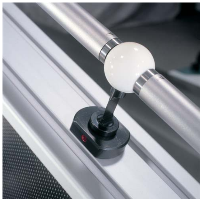
Figure 2: Ball on the spring element between two distance tubes