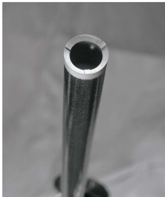
Figure 4: CFC-tube with carbide 3-point contact

Distance tubes of CFC-material with coefficient of thermal expansion of 0 do not react to fluctuations in temperature and merely show the uncertainty of measurement of the measuring instrument without any influence of the environmental conditions.